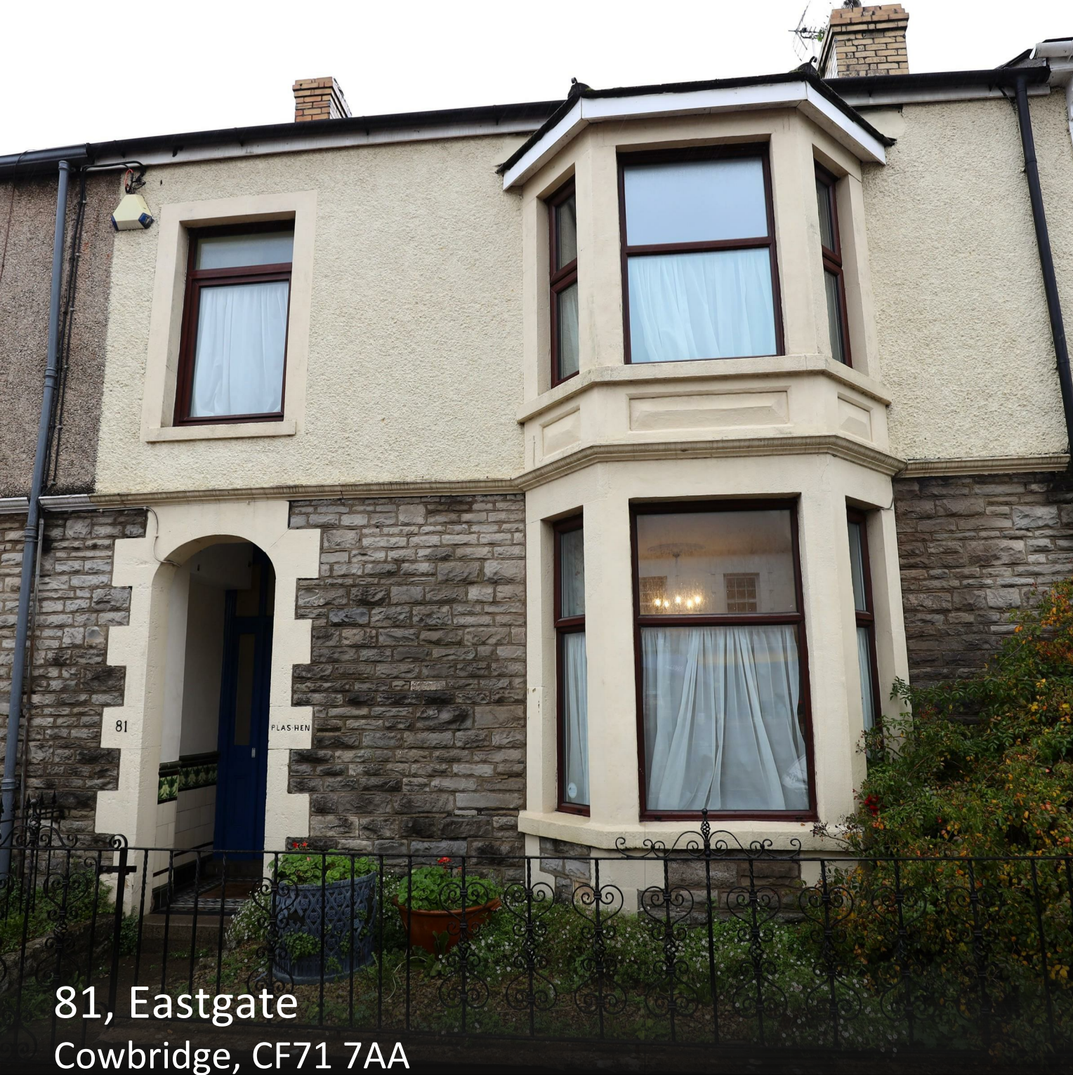
81, Eastgate Cowbridge, CF71 7AA